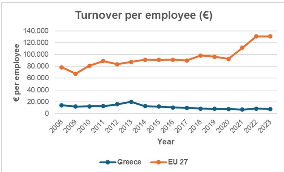
Figure 1: Evolution of turnover per employee (€ per employee) in the sector “Forestry” of the bioeconomy in Greece and the European Union (EU-27) over the period 2008–2023.

Figure 1 shows the evolution of turnover per employee (€ per employee) in the sector “Forestry” of the bioeconomy in Greece over the period 2008–2023, compared with the corresponding average for the European Union (EU-27).